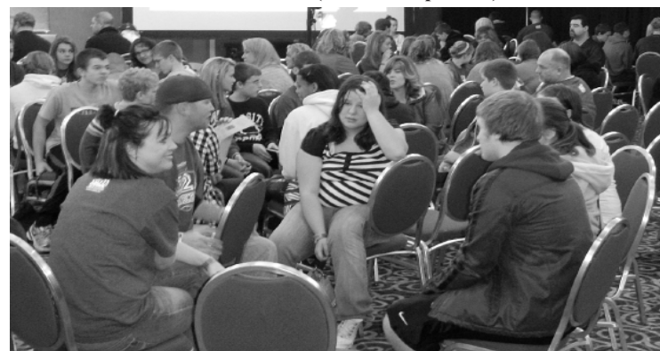
Part of the large crowd at ALIVE in their small group discussion