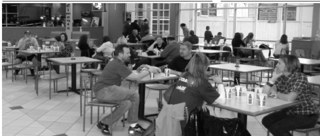
Some of the "not so Alive" Enjoying Pizza at the Rec Plex while the ALIVE Ones skate....