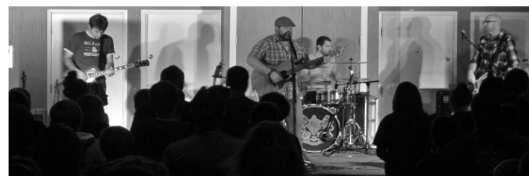
Broken Vessels (the Worship Band)

The Alive Committee would like to thank you for all the support and prayers, and we look forward to seeing you at the 2012 Alive Conference. Be looking for our new website coming early 2012. Like us on Facebook: Alive Ministries - Youth Alive Conference.