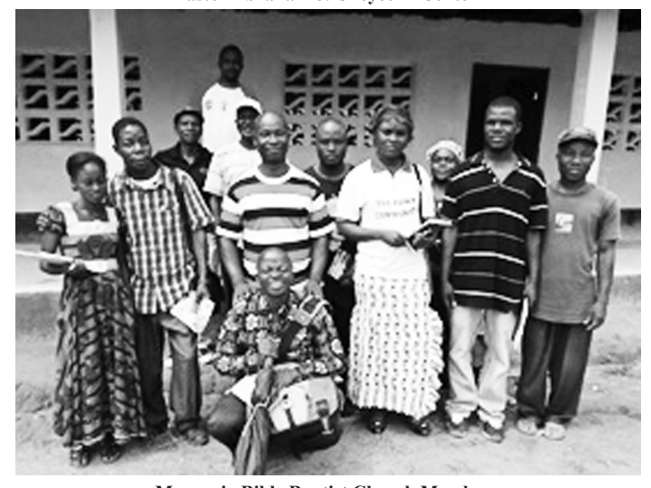
Monrovia Bible Baptist Church Members

Page 3 • Missouri Missionary Baptist • February 9, 2016