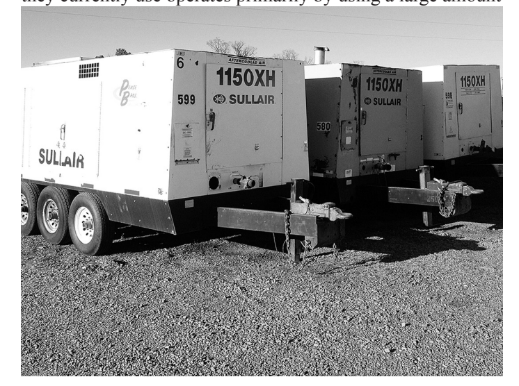
Page 8 • Missouri Missionary Baptist • March 10, 2015

A problem the team will face on next month's trip is that it is the dry season in Ghana and water is scarce. The drilling rig they currently use operates primarily by using a large amount