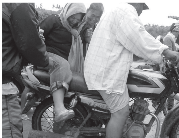
Time for a bike ride to the church