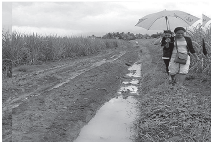
Attendees brave the elements to get to their meeting

As we look at the hardships these ladies endured while serving the Lord with joy in their hearts, it makes us wonder just how much we would sacrifice to “Serve the Lord with Gladness.” This should be an example and inspiration to us all. We are encouraging all the ladies of the WMA of America to support their local WMA.