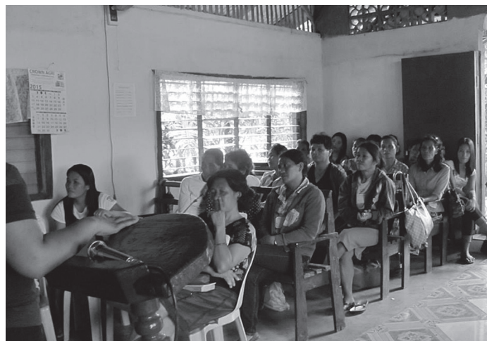
These ladies are dedicated to the cause