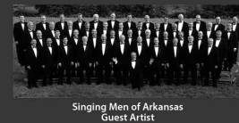
Singing Men of Arkansas Guest Artist