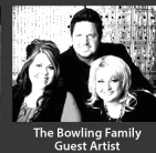
The Bowling Family Guest Artist