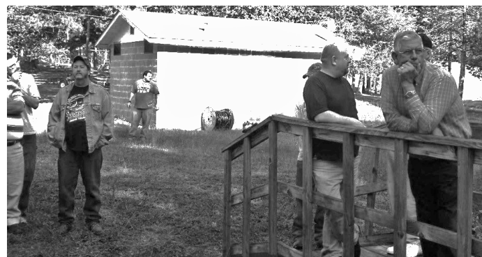
Some non-participants watch the "action."