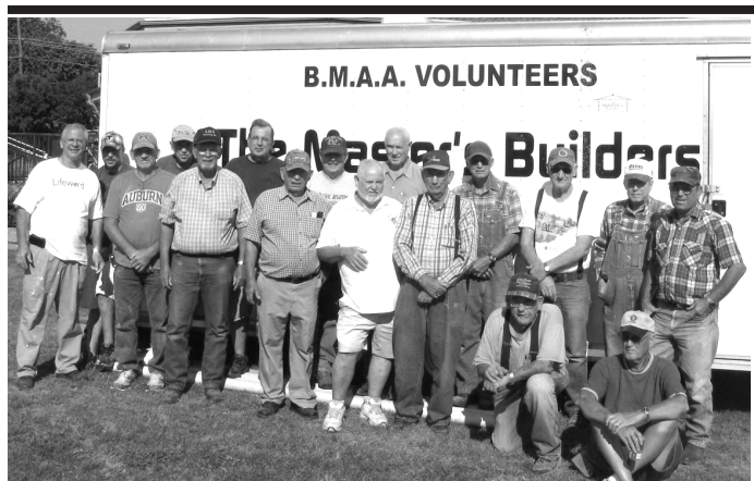
The Group Who Worked at Northside