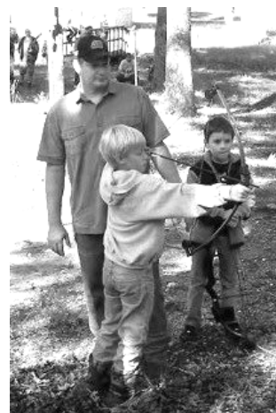
Some dads mentoring their sons who are just beginning