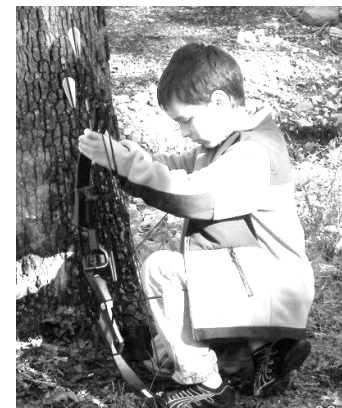
At least one took the competition very seriously