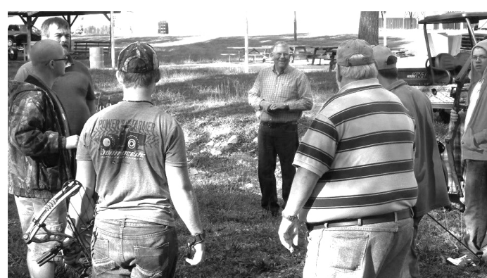
Participants and Spectators visit between contests