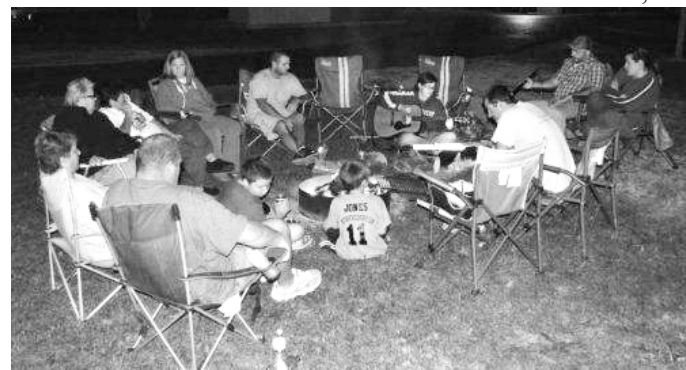
"Campfire Fellowship" at Northlake Mission in Smithville, MO

tion: "Where are you in your faith?" That may seem like a simple question, but it led to a great discussion and some honesty among friends. We learned that on a scale of 1-10, many were as low as 2, and some were as high as 9 in their faith. We also admitted/confessed