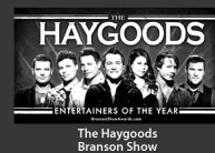
The Haygoods Branson Show