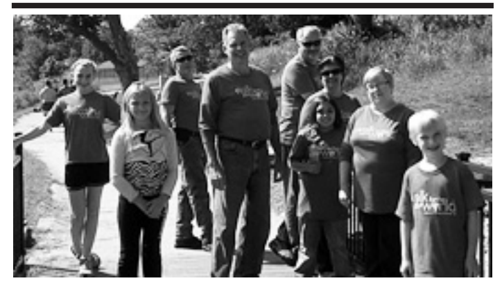
Some of the "Walkers" at the Walk of Faith of Charity Baptist Church in Columbia. See more pictures by going to their website: <a href="mailto:com/com/com/">comochurch.com/</a>

dwindled in an area, primarily due to persecution, many Jews immigrated to Israel and took their Torah with them. Once there, the local synagogue usually had their own Torah, so the immigrants would sell theirs to help them get started in the new land. The Torahs were usually bought by other synagogues or by collectors. The BMATS Torah is not a black market item — it was legally purchased with a clearly documented chain of possession from Jerusalem. It is technically non-kosher but will be cared for with the greatest reverence.