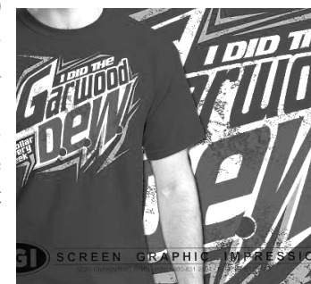
The DEW T-Shirt

One day at our 2013 Camp will be designated as “Wear your DEW Day!”