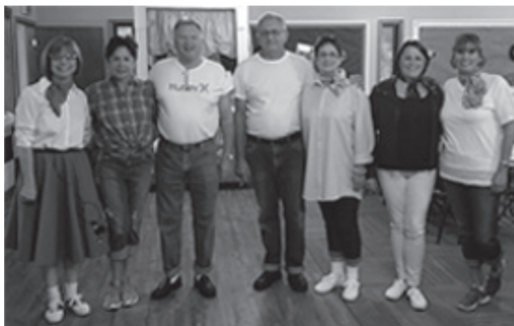
Kewanee had a 50's-themed fundraiser

The 2014 WalkfortheWorld/LifeWord Sunday season (July 1st through June 30 of the next year) ended June 30, 2015. We'd like to thank the top-giving churches for their efforts. Here are the top five donating churches, in order, for 2014: Spring Creek in Springdale, Arkansas; Hall Summit in Hall Summit, Louisiana; Kewanee in Kewanee, Missouri; Antioch in Conway, Arkansas; Rosewood in Gilmer, Texas.