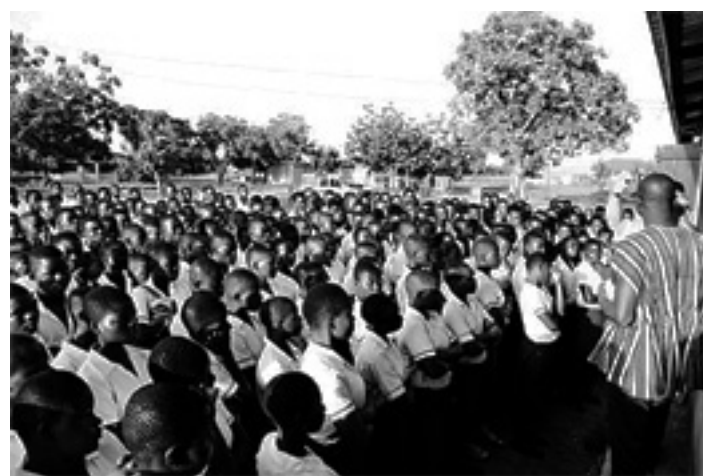
Young people in Ghana hear the Gospel