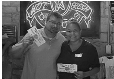
Partnering with a donut shop to give 500 sweet rewards to kids

Callison Elementary wanted to do something special to reward their students for exceptional behavior. We got together