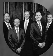
GOLD CITY CONCERT