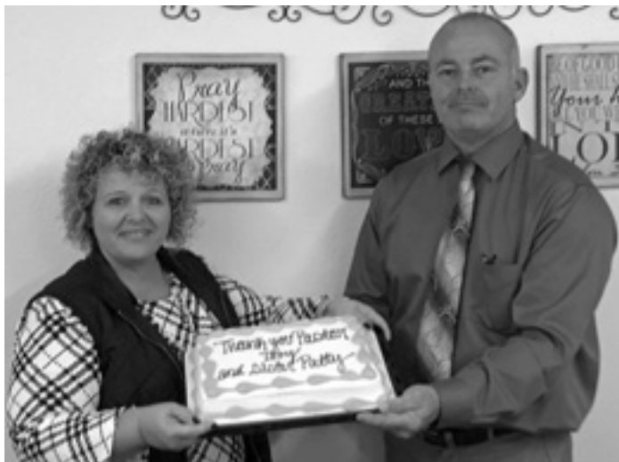
Pastor & Wife Appreciation at Ohlman