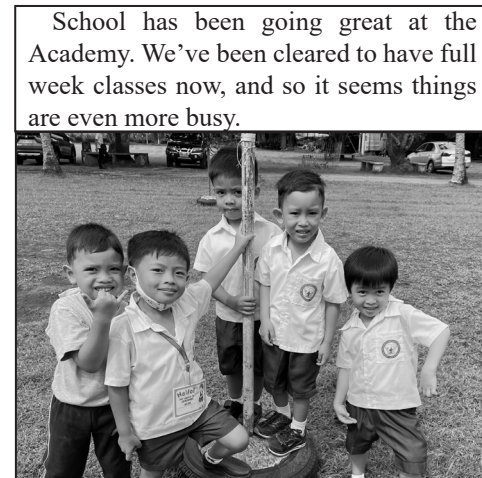
School has been going great at the Academy. We’ve been cleared to have full week classes now, and so it seems things are even more busy.