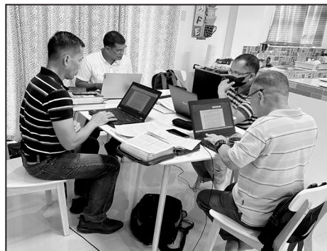
Four of our master level students begin taking their exit exams. There are four exams – December, January, February and March.

We are excited to have our first mission organization of a work we sponsored. It has been a labor of love, and we’re grateful that our Lord has allowed the mission to grow numerically and spiritually to the point they are now a New Testament church. We are thankful for First Missionary Baptist Church for extending the arm and supporting the mission as its mother church.