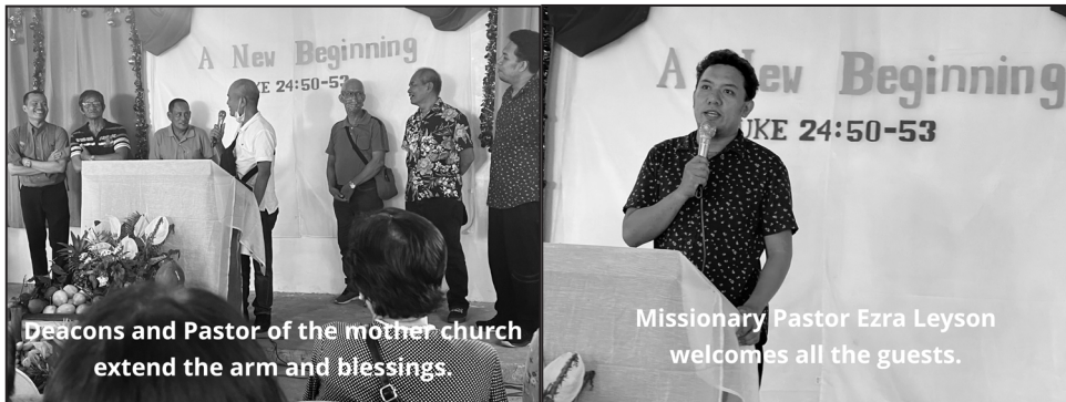
Deacons and Pastor of the mother church extend the arm and blessings.