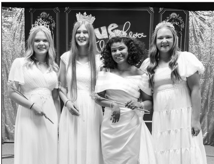
Queens from Missouri