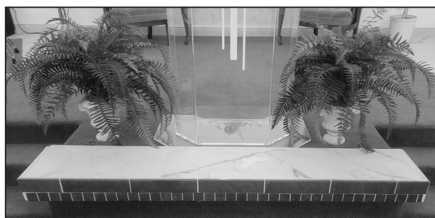
Abundant Life in Christ Renovations